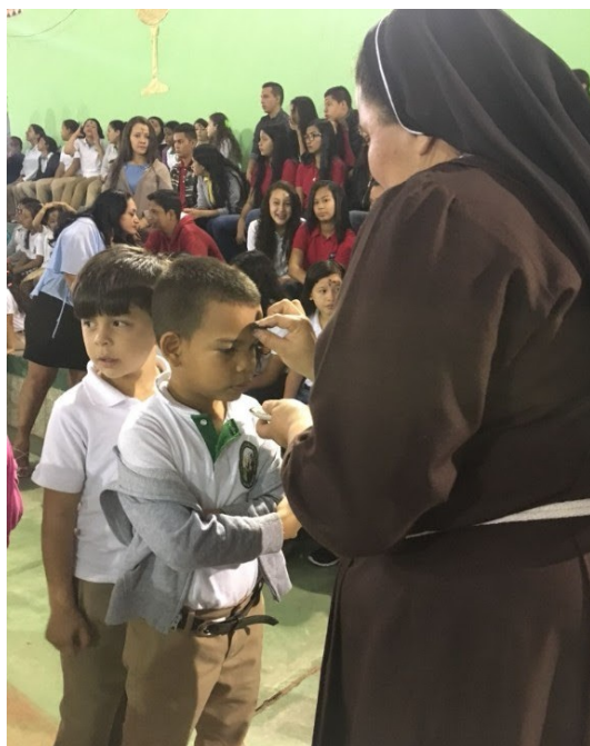
Students began the journey of Lent today by receiving ashes.